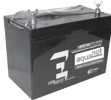
Aquanot® Deep-cycle Battery (purchase separately) P/N 10-1450 - AGM (shown) P/N 10-0761 - Wet

WARRANTY - 12 months from date of installation or 18 months from date of manufacture. However the 12-month warranty is extended to 36 months with the purchase of an Aquanot® Battery by Zoeller®. NOTE: Three-year limited warranty is valid only when a complete system is purchased and used as a backup to a primary dewatering system. A complete system includes a Model 508 and an Aquanot® Battery.