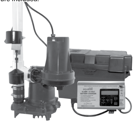
Primary pump not included. Product may not be exactly as shown. For preassembled systems, order a Pro Pak.