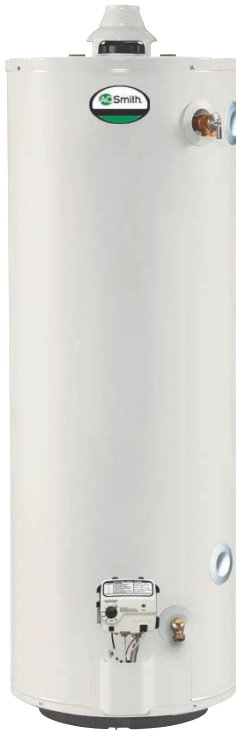
All ProMax SL water heaters are equipped with side-mounted recirculating taps.