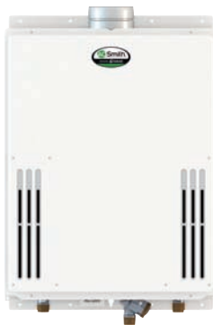
Heavy-Duty Commercial Gas Models