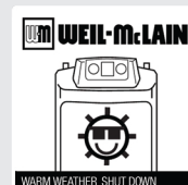
WARM WEATHER SHUTDOWN