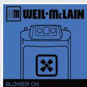
START/END OF HEATING CYCLE