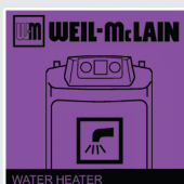
PROVIDING HOT WATER