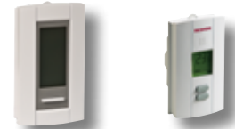
Programmable and non-programmable thermostats available with electric floor heating system, Model EFMA.