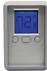
Closeup of digital control