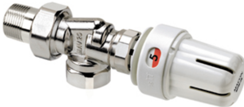
MTW shown with Macon NT series valve

The MTW is a self-acting adjustable non-electric thermostatic operator. It has anti-freeze position, adjustable max./min. temperature, selected temperature locking feature and can be shutoff completely if required. Each MTW thermostatic operator is individually calibrated and conforms to ASHRAE standardization rules for temperature regulation. The MTW's smooth shape and narrow air gaps gives a nice operation and makes it easy to keep clean. Can be mounted on all Macon NT series valves. Millions are in use throughout the world.