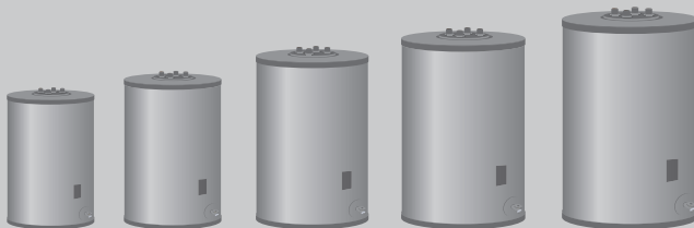
5 Sizes Available

This unique warranty provides a 10-year full tank replacement, two years of labor coverage, and one year on parts.