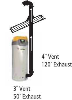
Power Vent Vertical