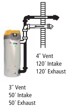
Direct Vent Sidewall