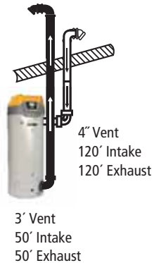
Direct Vent Vertical