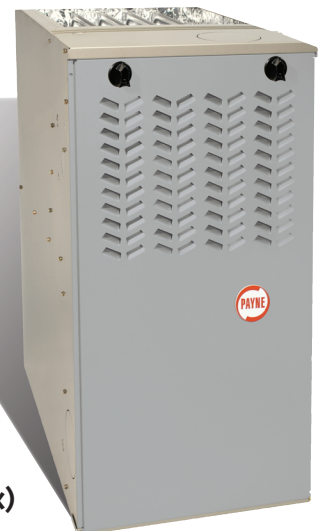
Models PG8M / PG8J (Low NOx)

No matter which model you choose, you can expect comfort and savings to continue for years because Payne products are designed, built and tested for long lasting operation.