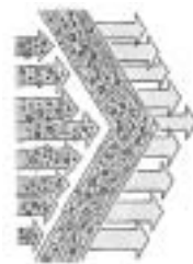
FIGURE 2 AIR BEAR® FILTERS