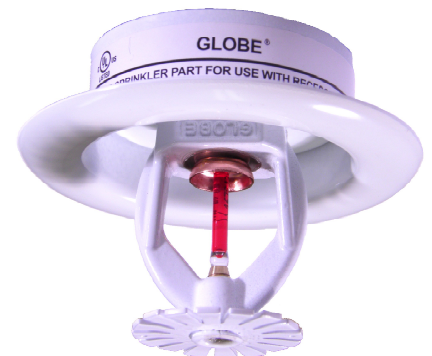
RESIDENTIAL RECESSED PENDENT