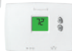
PRO 1000 Horizontal Non-Programmable