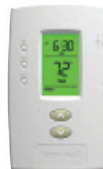
PRO 2000 Vertical Programmable