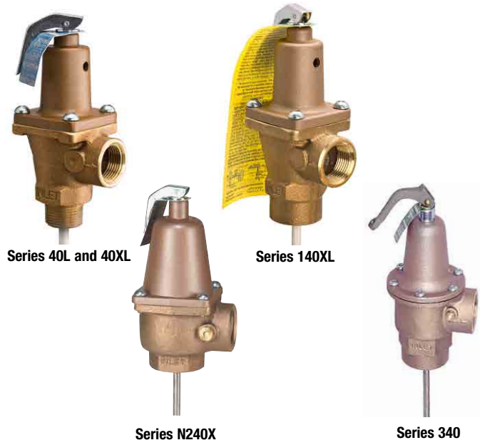
Series 40L and 40XL

ASME Rated, ANSI Z21.22, Design certified and listed by CSA, National Board of B&PVI to Section IV of the ASME B&PV code and meet current FHA requirements and ANSI Z21.22 in addition to Military Spec. MIL-V-136-12D, Type I.