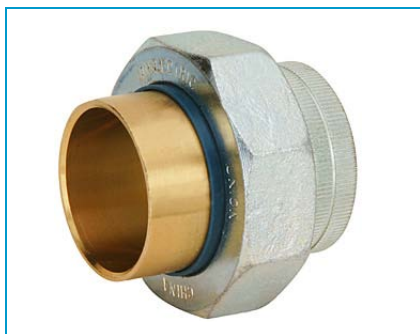
Female X Sweat