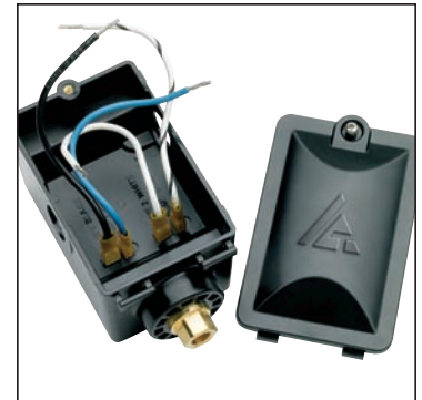
Access cover is sealed against moisture and bugs.