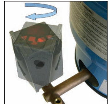
Spins on—no special fittings. LED display rotates 180°.