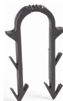
No. FBSN2 2 1/2-in (63.5mm) 2-N FOAMBOARD STAPLE