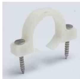
No. PWS2 1-1/16-in (27.0 mm) PEX TO WOOD STAPLE