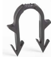
No. FBSN1 1-1/2-in (38.1 mm) 1-IN FOAMBOARD STAPLE