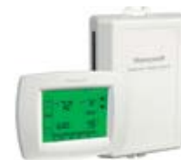
YTH9421C VisionPRO IAQ Thermostat with Equipment Interface Module (EIM)