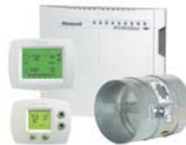
Y8835A Networked Zoning Systems