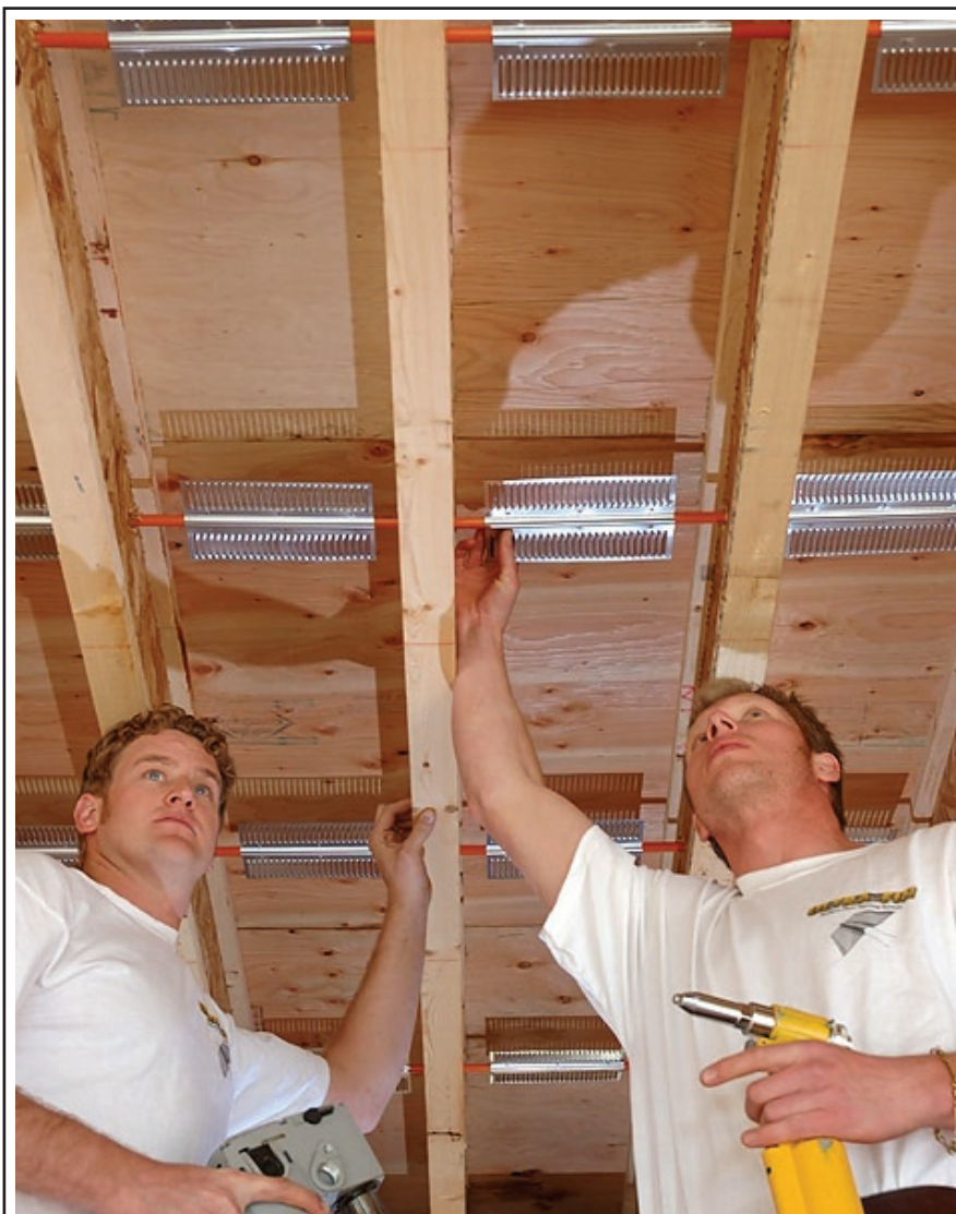
Ultra-Fin Radiant Floor Heating System installed from below