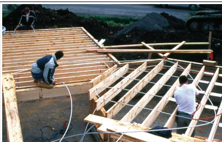
Ultra-Fin Radiant Floor Heating System installed from above

"We installed nine zones in two days, using half the materials of a conventional radiant system. More heat, less labour, simpler system. It doesn't get any better than this! "