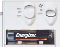
Front Loading Battery Door

Toll-Free Technical Service number printed right on the thermostat provides immediate assistance.